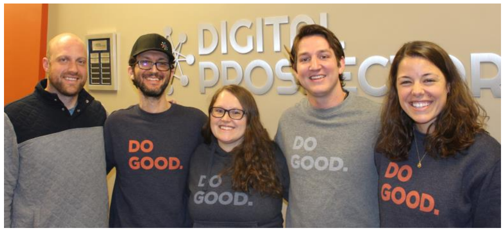
Digital Prospectors has supported Greater Seacoast Community Health for more than 14 years.

Abenaque Women’s League The Brook Coldwell Banker Residential Brokerage The Fabulous Find Lago’s Ice Cream LizFit Phi Sigma Sigma Rolling Green Nursery